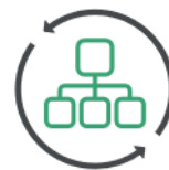
Auto Sync Level